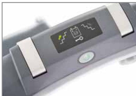
Display showing all functions at a glance