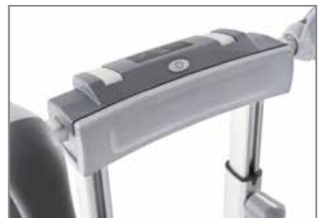
Comfortable cushioning for resting the operating unit on the thigh while climbing the stairs