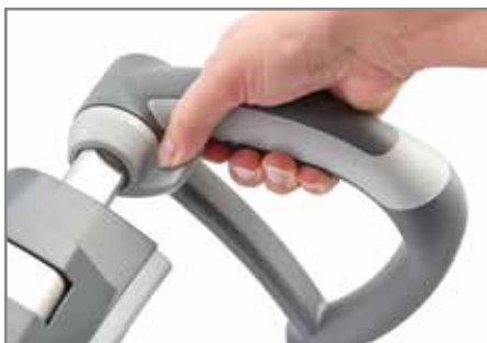
ErgoBalance grips: non-slip with a convenient shape

scalamobil and scalacombi adapt to your needs – not the other way around. The grip unit can be adjusted in height and width and thus adapts optimally to the person operating it and to the stairs.